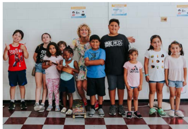
Pictured: Olympic skateboarder Bryce Wettstein with students at Memorial Recreation Center in Logan Heights.