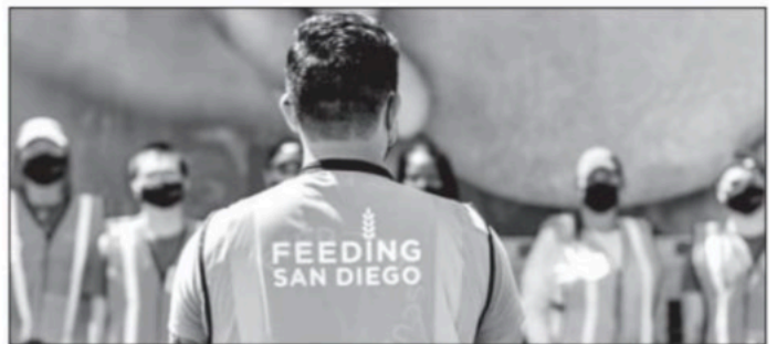
THE SHOPPES AT CARLSBAD will be the site of Feeding San Diego's monthly drive-through food distribution for North County families, from 10 a.m. to noon July 28 and every fourth Wednesday, at 2525 El Camino Real, Carlsbad, on the northwest side.

"Our large-scale distributions are still very much needed as our local economy continues to recover from the pandemic."