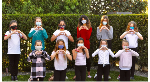
Girl Scout Troop #4978

"My Girl Scout troop #4978 really wants to help those facing hunger in San Diego for our Bronze