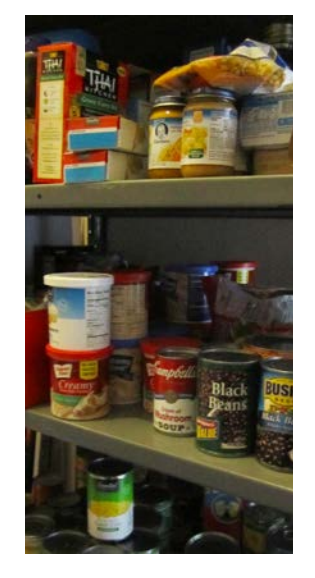
Selection of groceries in JCC's pantry

The generosity of Feeding San Diego's community—including volunteers like Melodee, donors, and food industry partners—provides consistent and dignified access to healthy food to help our neighbors make ends meet.